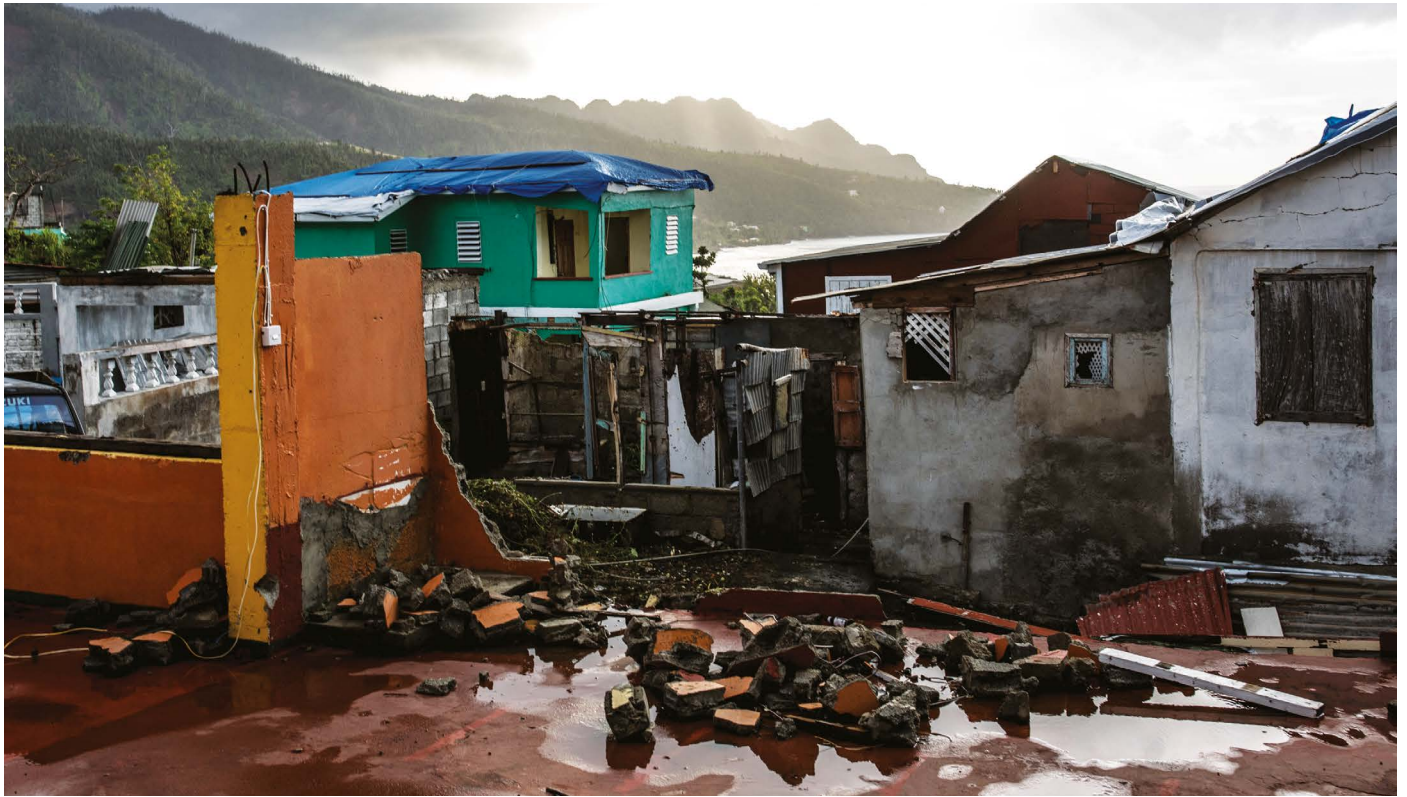
The effects of Hurricane Maria in Dominica in 2017 caused millions of dollars' worth of damage to the country's economy.